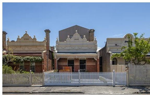
Photo credit: Architect: gestalten and Photographer: Markus Weber Photography