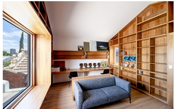
Photo credit: Architect: gestalten and Photographer: Markus Weber Photography

Total construction development duration (months) 9