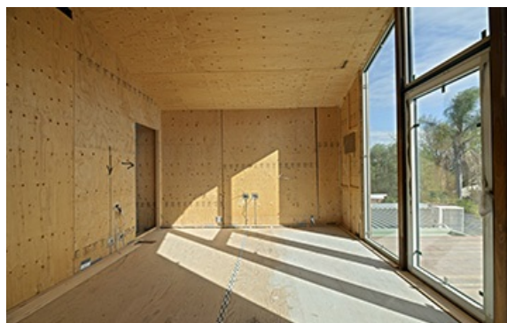
Photo credit: Architect: gestalten and Photographer: Markus Weber Photography