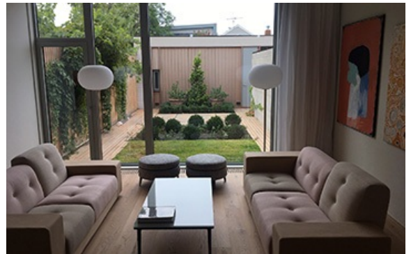
Photo credit: Architect: gestalten and Photographer: Markus Weber Photography