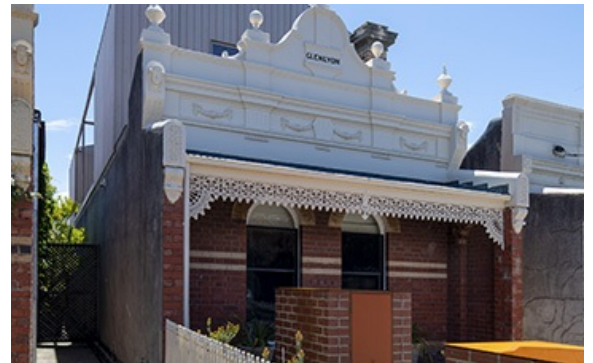
Photo credit: Architect: gestalten and Photographer: Markus Weber Photography