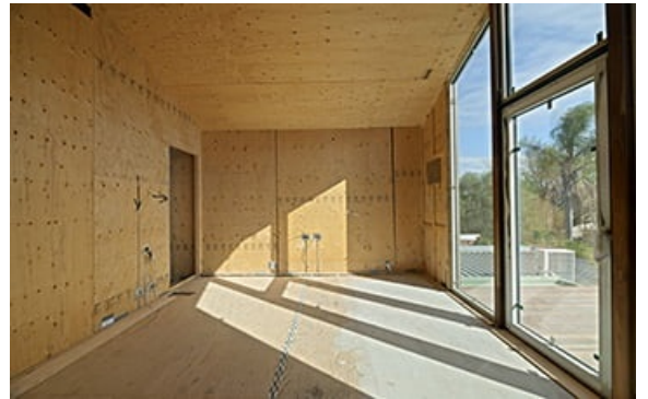
Photo credit: Architect: gestalten and Photographer: Markus Weber Photography