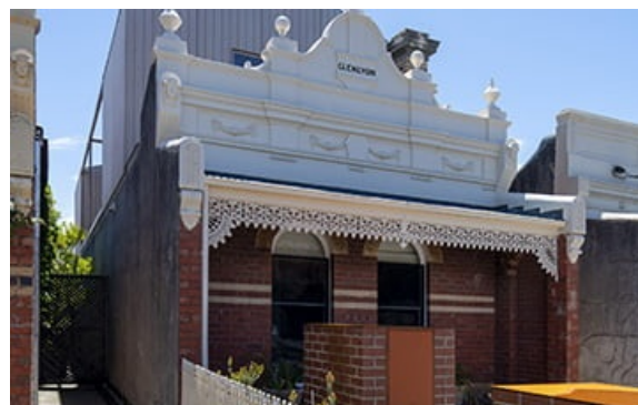
Photo credit: Architect: gestalten and Photographer: Markus Weber Photography