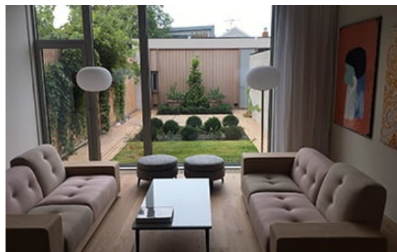
Photo credit: Architect: gestalten and Photographer: Markus Weber Photography