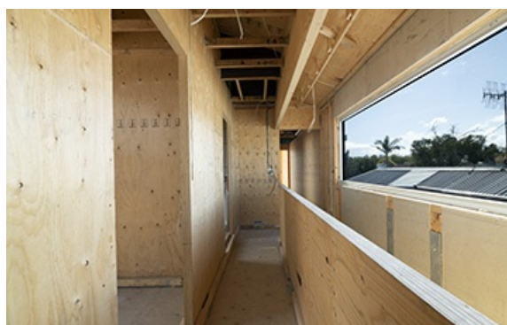
Photo credit: Architect: gestalten and Photographer: Markus Weber Photography