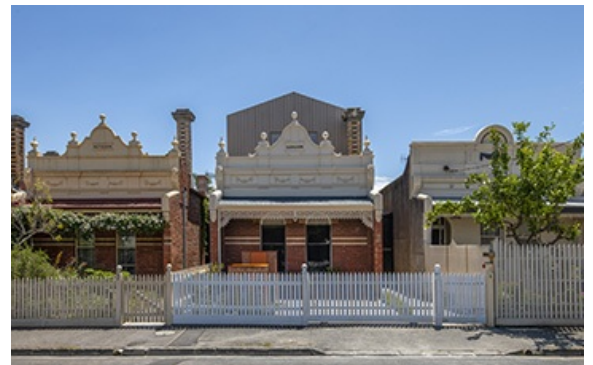
Photo credit: Architect: gestalten and Photographer: Markus Weber Photography