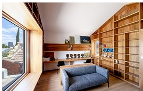
Photo credit: Architect: gestalten and Photographer: Markus Weber Photography

Total construction development duration (months) 9