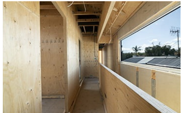
Photo credit: Architect: gestalten and Photographer: Markus Weber Photography